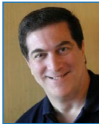
Print Education Ed Medici