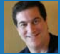
Print Education Ed Medici